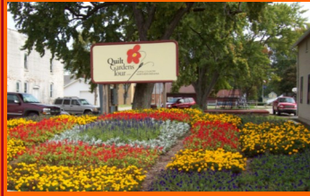
Quilt Gardens viewable from May 25 thru October 1, 2009 QuiltGardenTour.com/800.377.3579