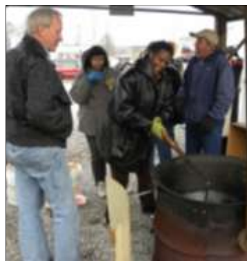
After having a hand at stirring and watching a batch of popcorn pop, she was excited to have some "she made herself!"