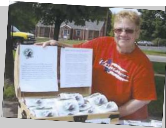
Taking Craft and Commercial Applications until April 8th. Forms online. (sorry non-electric only)