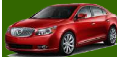
2011 Buick Lacrosse