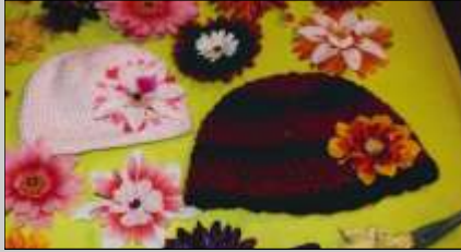
Z Stick Enterprise - Columbia City

Ellie Mays Goat Milk Products: Soap straight from the Goat! Beverly Crussemeyer, Bristol, milks the goats and makes her natural goat milk soap. She also sells hand lotion bars, natural but not from goat milk.