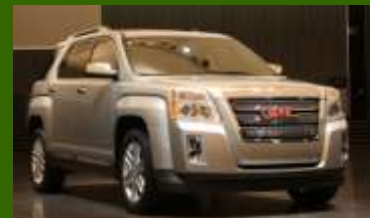
2011 GMC Terrain

McCormicks Motors will feature at car show: